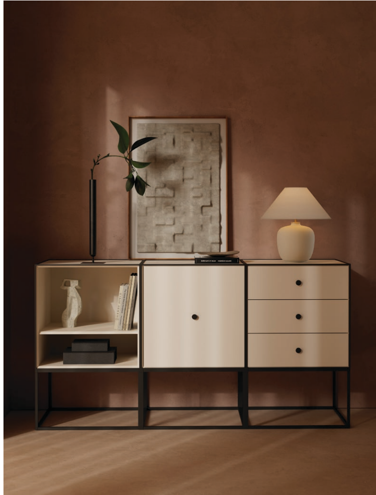
FRAME 49 TRIO SIDEBOARD Designed by Audo